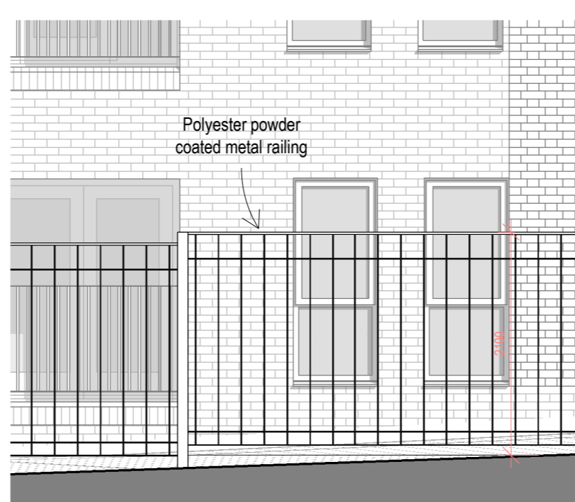
BOUNDARY TYPE A ELEVATION 1 : 50